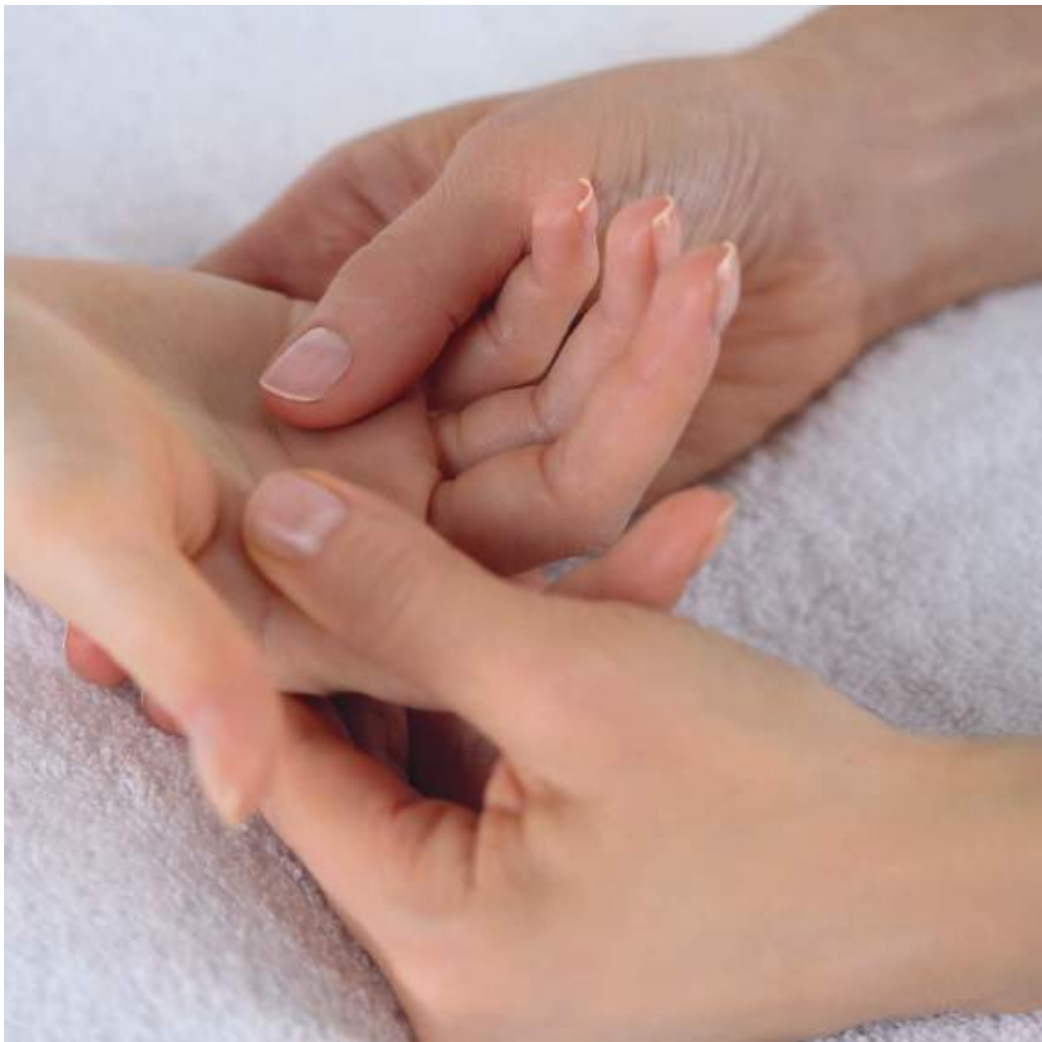
Hands and feet