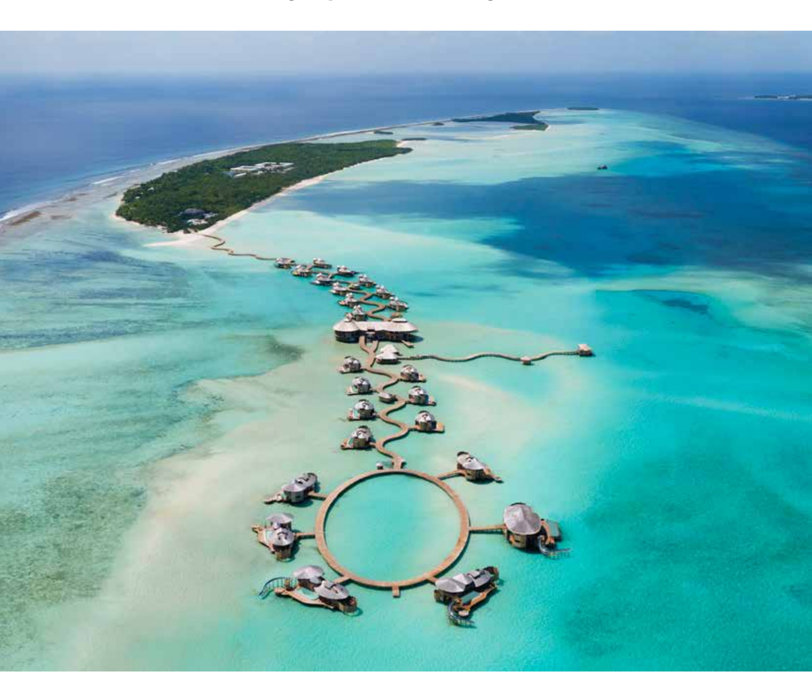
Noonu Atoll - Maldives