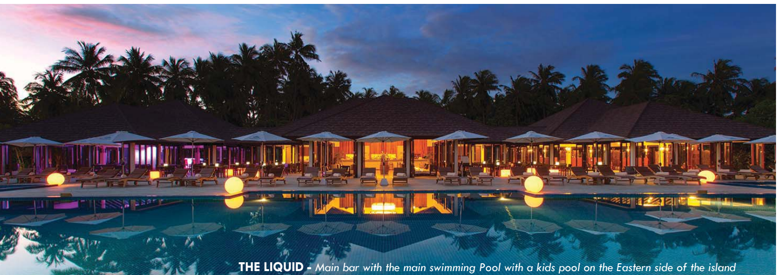
THE LIQUID - Main bar with the main swimming Pool with a kids pool on the Eastern side of the island