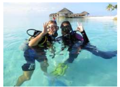
descriptions in the next pages.

If you like the ocean and snorkeling, the chances are you'll love diving!